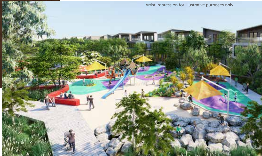
Artist impression for illustrative purposes only.