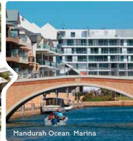
Mandurah Ocean Marina