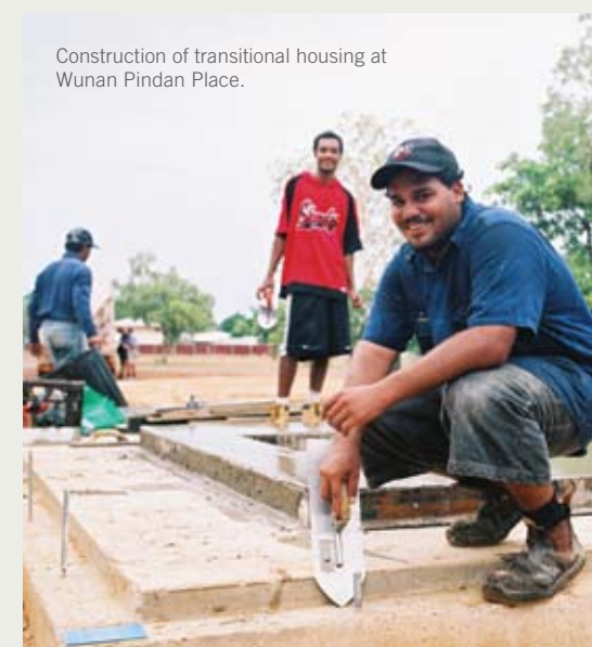
Construction of transitional housing at Wunan Pindan Place.